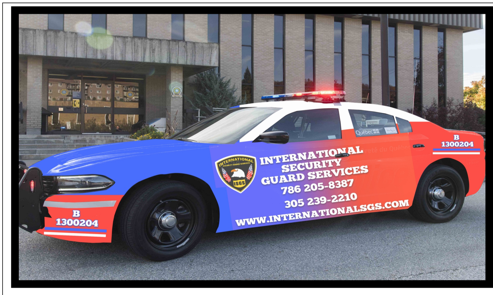
Image is essential, and ISGS Protections & Detective Agency maintains that your image is always secured by the clean and professional appearance of our security officers.

Military • Executive • Business Casual • Outdoor Wear • Bike Patrol Can be Customized as per your Requirements